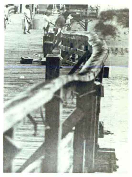
1975 Image of Frisco Pier (ACOE)