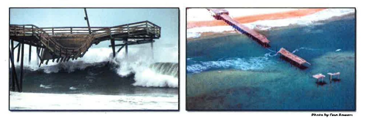
Post Hurricane Earl Images of Frisco Pier