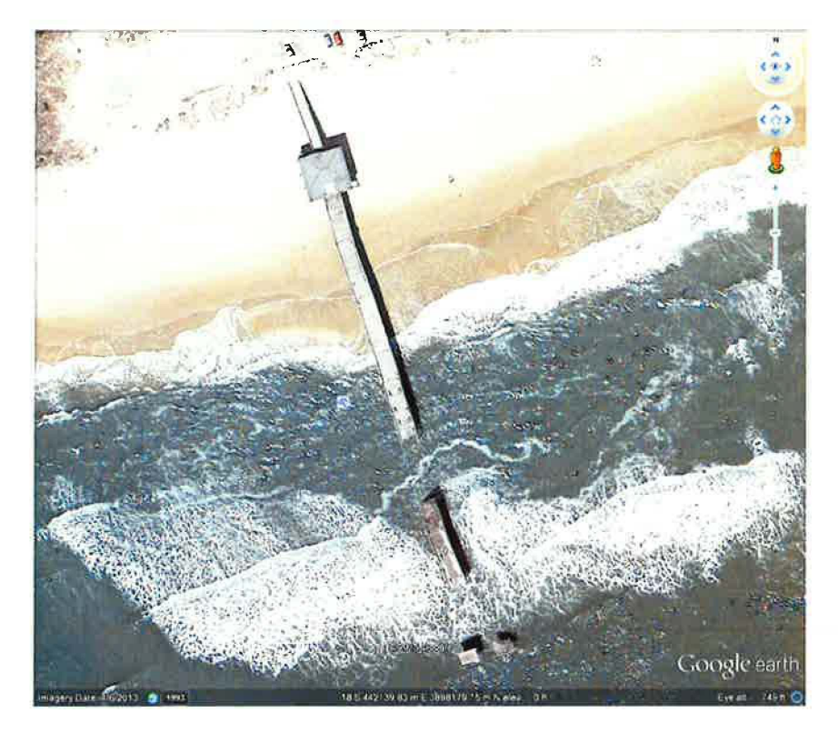
Google earth Image of Frisco Pier